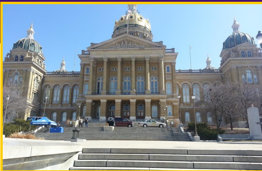
The Capitol Building in Des Moines, IA. Two McNair Scholars represented UNI at the Research in the Capitol event on April 1st.