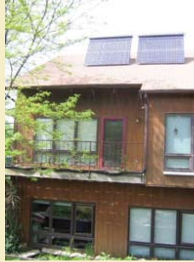
Above right: The home of Carole and Jack Yates features a photovoltaic system (solar electric) that produces 85% to 90% of the home's electrical needs and a solar thermal/evacuated tube system for domestic hot water and in-floor heating.

The Yateses are also known across campus for biking to work, even during the brutal Iowa winter. That's what we call dedication to a cause.