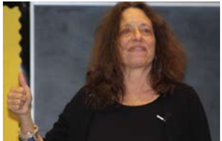
Dr. Carol Gilligan visited campus in April.