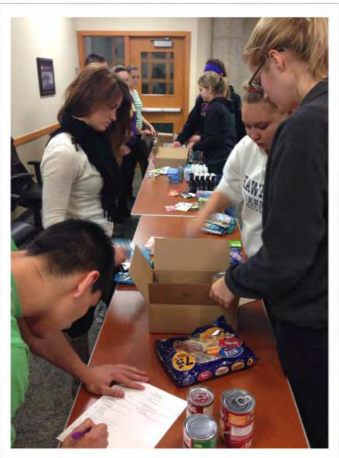
Above: Making care packages for troops in Afghanistan. Left: Members assisting with judging at the sixth grade science fair at the Grout Museum