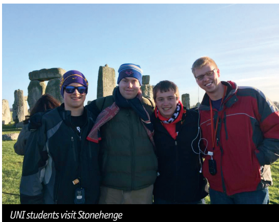
UNI students visit Stonehenge