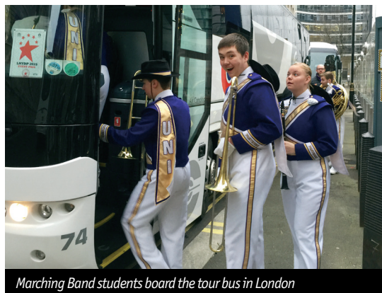
Marching Band students board the tour bus in London

sightseeing and adventure. Her favorite aspects of the trip? "Walking around London, the Harry Potter tour, riding the Underground, riding a double decker bus, marching in the parade and watching the fireworks for New Year's by the London Bridge!"