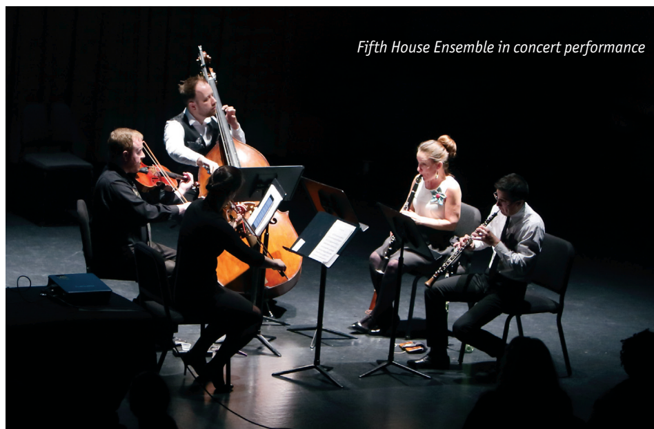
Fifth House Ensemble in concert performance

On Friday, Oct. 17, in Russell Hall's Bengtson Auditorium, members of the ensemble offered a school-wide lecture, followed by a reception. That evening,