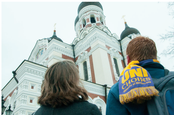
Members of Concert Choral looking at Alexander Nevsky Cathedral in Tallinn