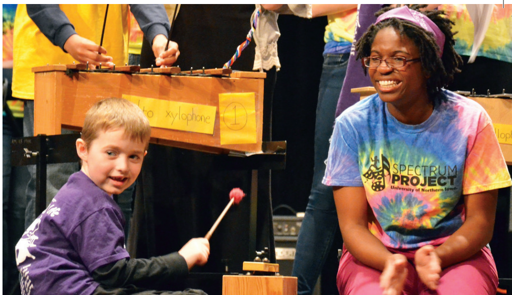
UNI students interact with Spectrum Project participants at the Symposium