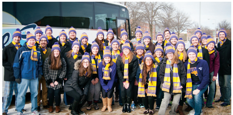
Concert Choral preparing to depart for their Estonia tour