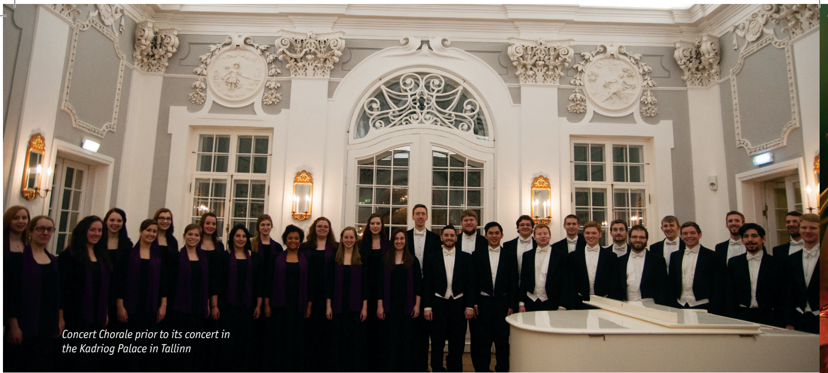
Concert Choral prior to its concert in the Kadriorg Palace in Tallinn