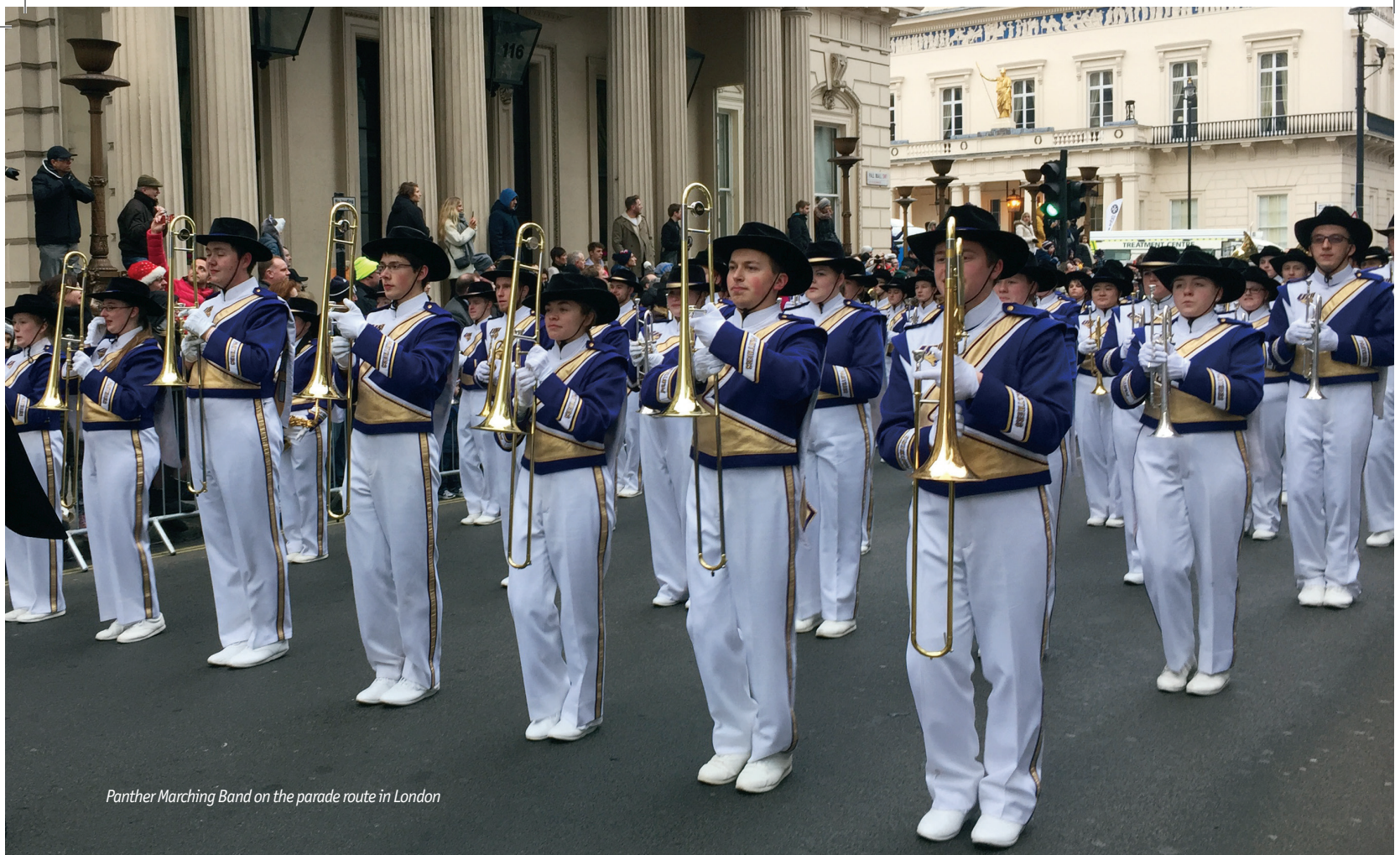
Panther Marching Band on the parade route in London