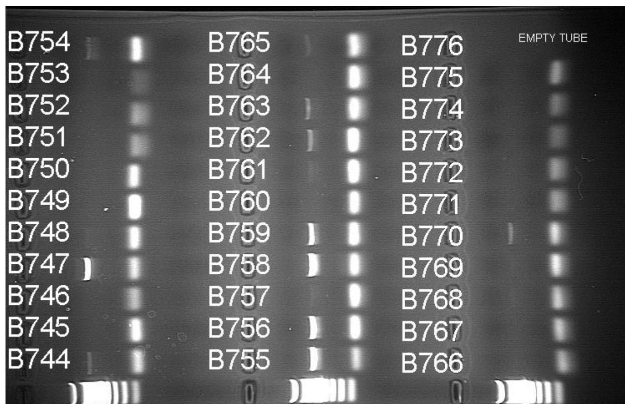
Figure 2: Agarose gel image of positive amplifications of DNA seen where there are multiple bands next to the sample number.