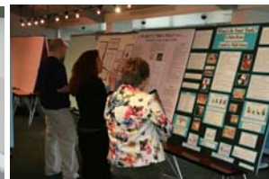
AM Poster Session