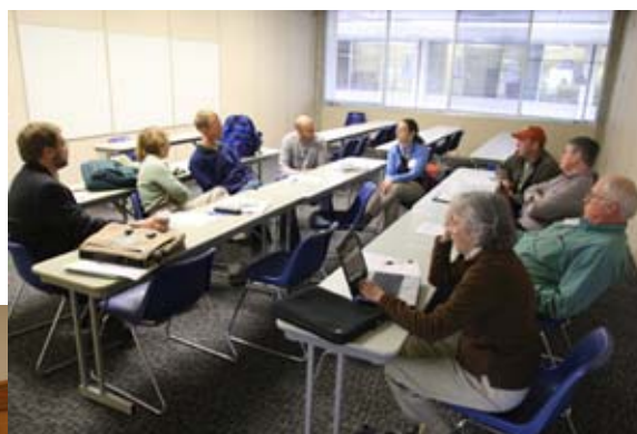
Iowa Natural Heritage Association Workshop at the IAS Annual Meeting