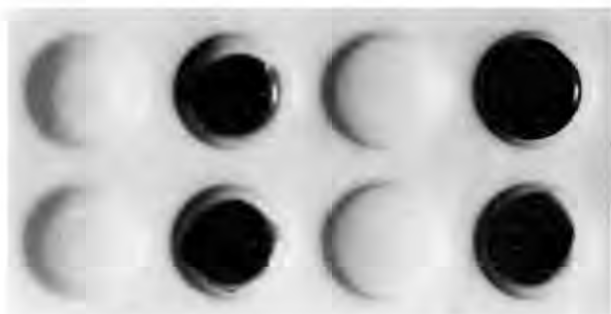
Fig. 3. Production of dark blue starch-iodine complex resulting from treating colloidal solutions of potato amylose (top row) and C. kutscheri -produced amylose (bottom row) with (left to right) no treatment, Gram's iodine, amylase plus Gram's iodine, and amylase heated to 100C plus Gram's iodine.

determined. However, the availability of our method of extraction of bacterial starch should speed the clarification of some of these perplexing problems.